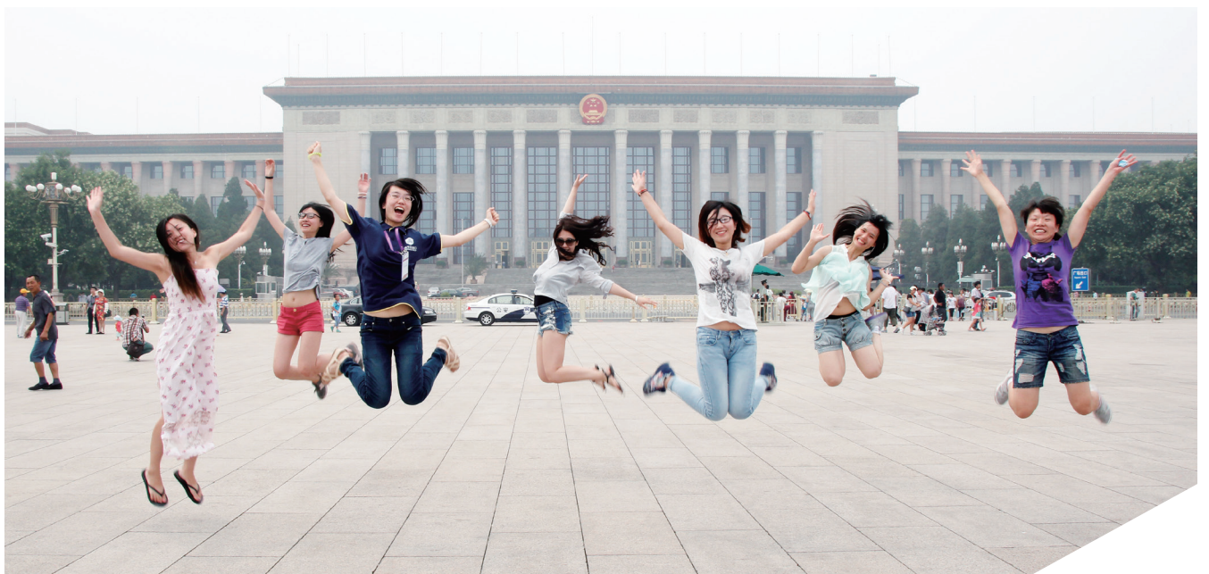
Touring the Tian'anmen Square