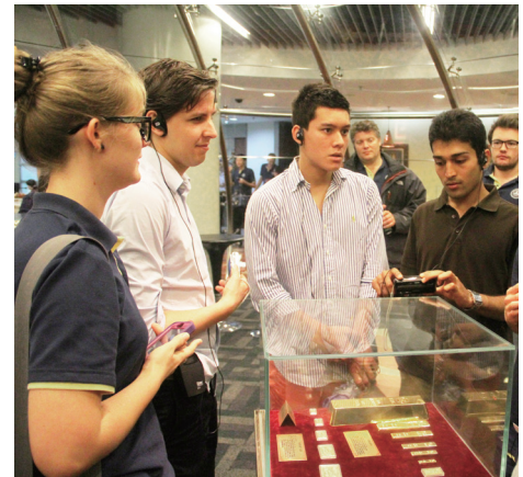
Visiting the Industrial and Commercial Bank of China