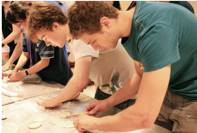
Making Chinese Dumplings