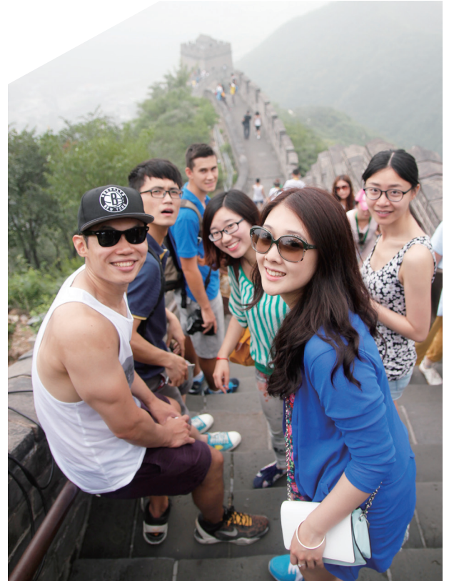
Touring the Great Wall

Additionally, cultural events and tours to popular local attractions will give the attendees a glimpse of the fascinating Chinese culture.