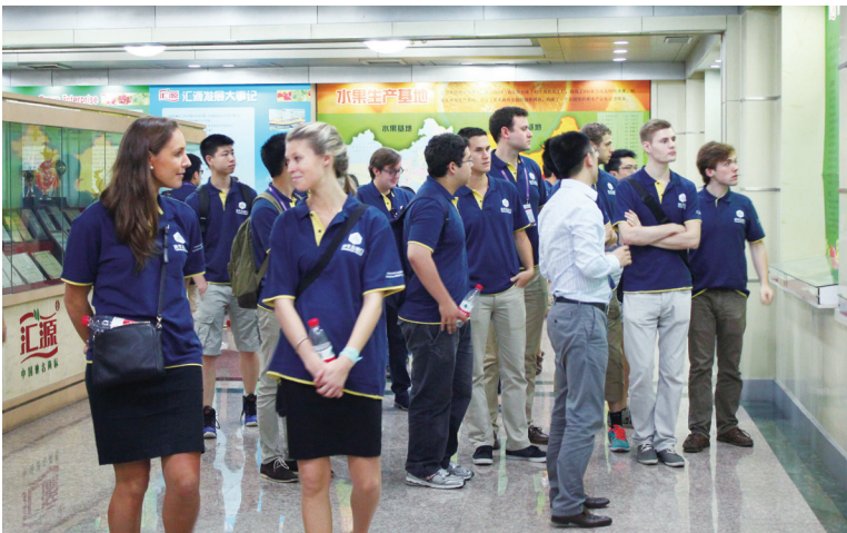
Visiting Huiyuan Group Corporation

Capitalizing on the School's close industry connections, attendees will have the chance to visit major financial institutions to gain first-hand knowledge of Chinese financial markets.